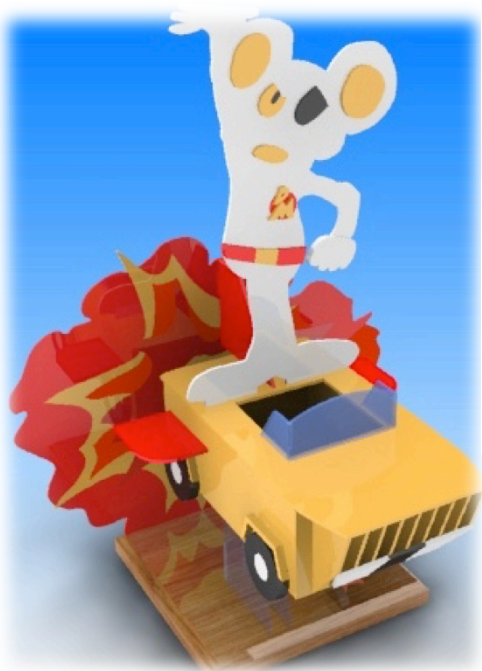
Pop Art Docking Station

Design and make a desk lamp, light, radio, phone charging stand or iPod docking station in the style of any design era of the last 100 years