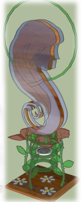
Art Nouveau Lamp